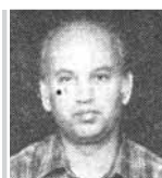
U.R. Rao 1985-87