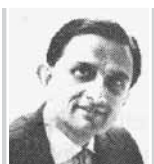
Vikram A. Sarabhai 1969-71