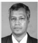
E. Desa 1999-05